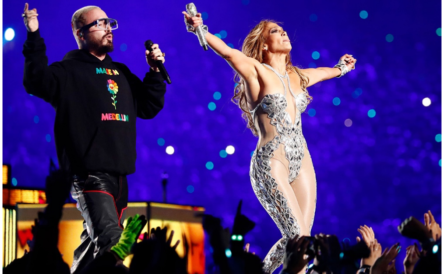
Jennifer Lopez performing with rapper J. Balvin.

In September 2019, it was announced that Jennifer Lopez, born and raised in New York City but of Puerto Rican heritage, and Shakira, born and raised in the Colombian city of Barranquilla, were selected to headline the show. Their selection was intended to reflect the Hispanic culture of Miami, which hosted Super Bowl LIV.