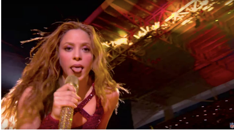
Shakira wagging her tongue in an Arab tradition known as "zaghrouta." The photo was trending on social media immediately following the performance.